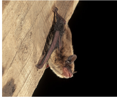
► Bats, like this evening bat ( Nycticeius humeralis ), are not destructive.

ANSWER: Bat houses are excellent management tools that can provide displaced bats with a safe alternate roost away from structures where they are unwelcome. And while it is true that "bats in a bat house are not in YOUR house," bats are faithful to their homes, and very rarely voluntarily leave an active roost for a bat house. The result